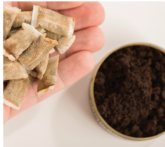
Gabon, Mauritius, Seychelles, and Togo to 23% in Sao Tome and Principe.

Ten percent or more of students currently used smokeless tobacco in 8 of the 25 GYTS countries in the African Region. Percentages ranged from 2% in